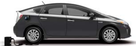
WINTER GRAY METALLIC