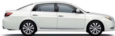
BLIZZARD PEARL 1