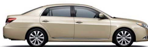
SANDY BEACH METALLIC