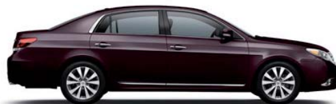
SIZZLING CRIMSON MICA