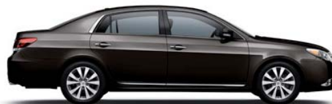
COCOA BEAN METALLIC