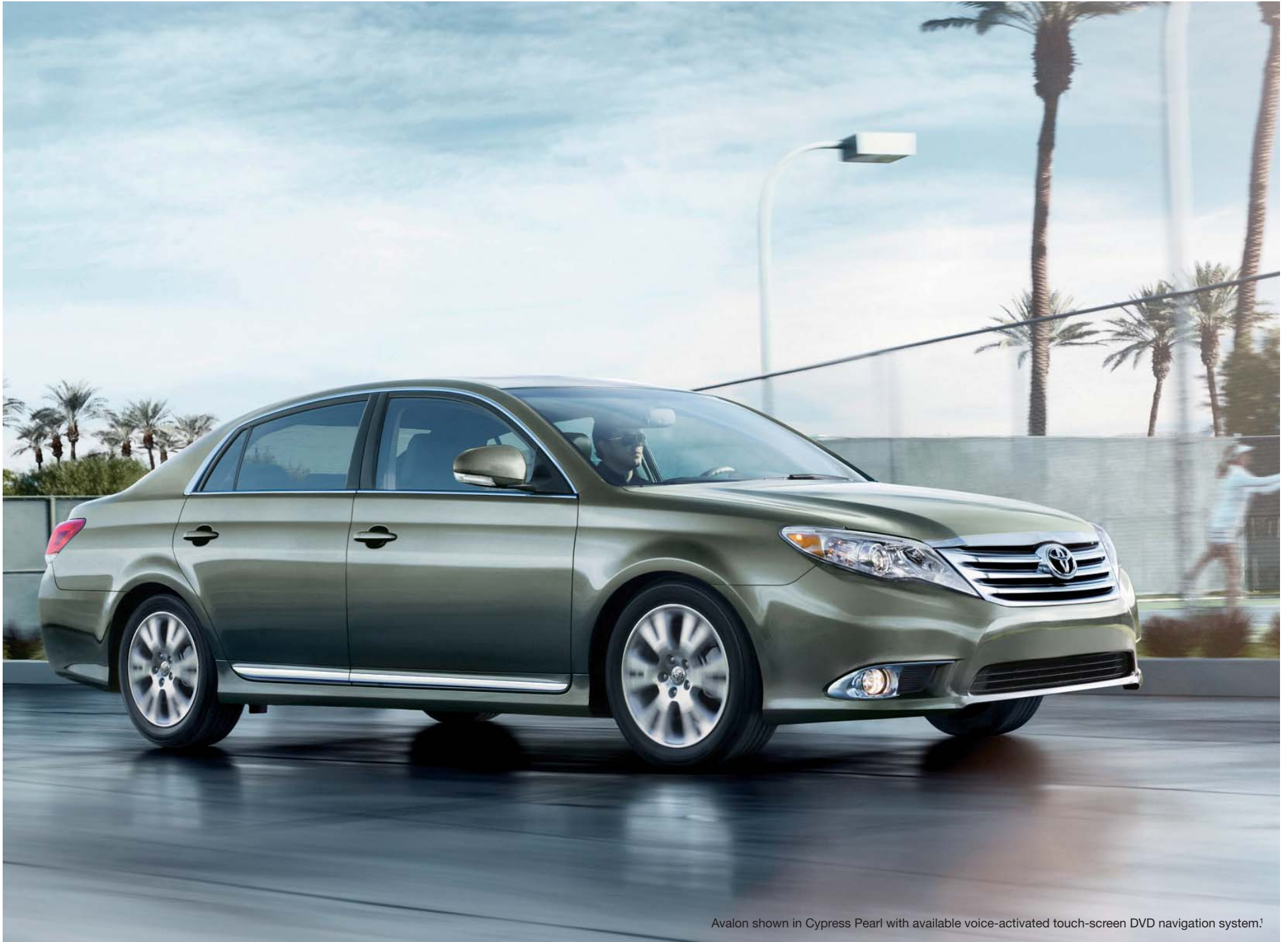
Avalon shown in Cypress Pearl with available voice-activated touch-screen DVD navigation system. 1