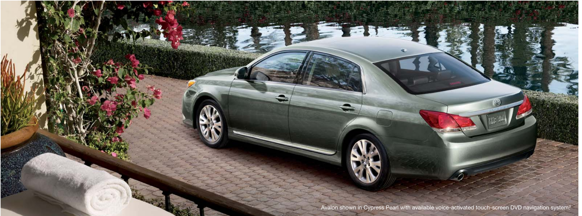
Avalon shown in Cypress Pearl with available voice-activated touch-screen DVD navigation system. 2

Step on Avalon's accelerator and you'll immediately become better acquainted with the enhanced lumbar support of the driver's seat. That experience is thanks to its powerful 3.5-liter V6 DOHC. But as responsive as it is, it's also remarkably fuel-efficient. Its Dual Independent Variable Valve Timing with intelligence (VT-i) optimizes power and efficiency, giving Avalon an EPA-estimated 20 city/29 hwy mpg rating. 1 Which bolsters your case for spending more time in the fast lane.