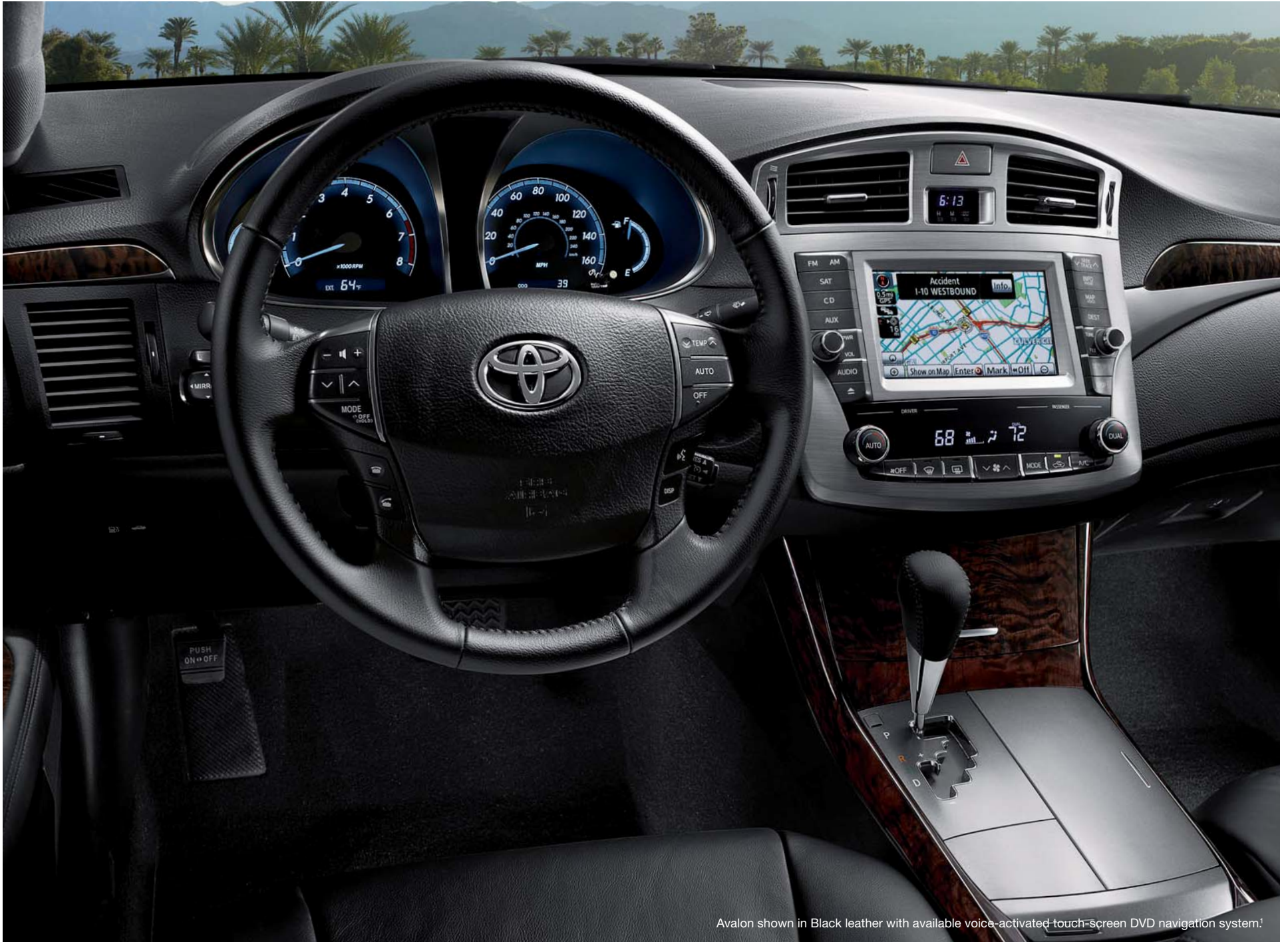
Avalon shown in Black leather with available voice-activated touch-screen DVD navigation system!