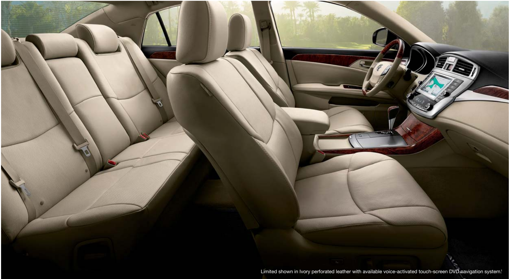
Limited shown in Ivory perforated leather with available voice-activated touch-screen DVD navigation system!