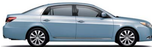
ZEPHYR BLUE METALLIC