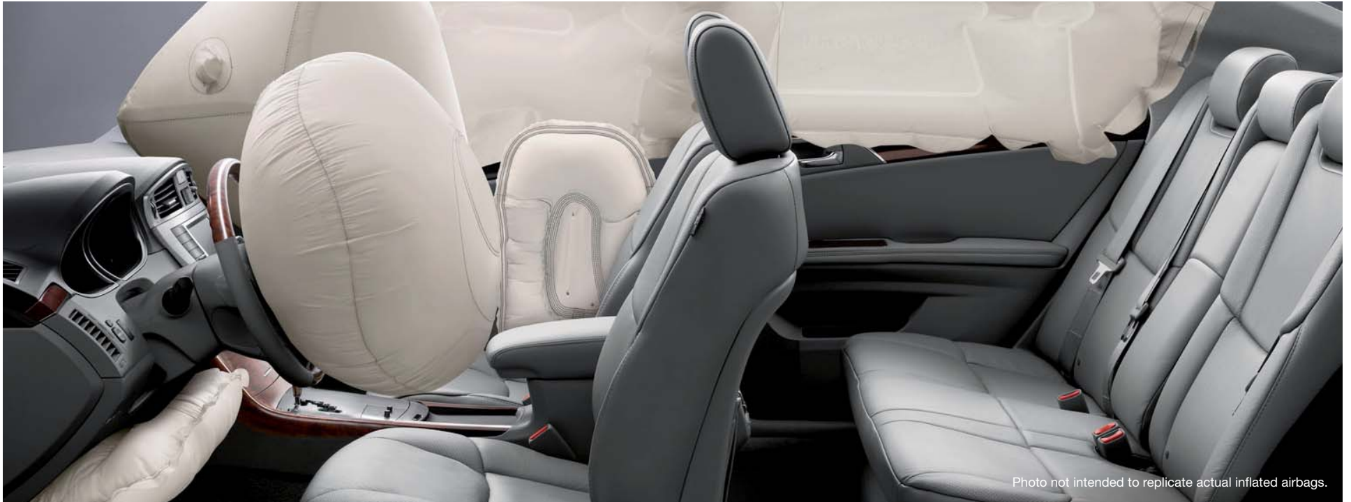
Photo not intended to replicate actual inflated airbags.

Avalon comes equipped with the Star Safety System, ™ an integration of advanced safety features that helps drivers avoid accidents in the first place. It includes Vehicle Stability Control (VSC), 1 Traction Control (TRAC), Anti-lock Brake System (ABS) with Electronic Brake-force Distribution (EBD), Brake Assist (BA) 2 and Smart Stop Technology (SST). 3 It's not every car that provides this level of safety as standard equipment. Just every Toyota. STAR ™ SAFETY SYSTEM